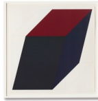
Sol Lewitt Forms Derived from a Cube (Colors Superimposed), Plate #03, 1991 Color screenprint 32 x 32 inches ed. 8/35 $5,000