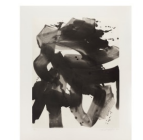
Mary Weatherford The Robot, 2018 Spit bite aquatint on gampi paper chine collé 35 1/4 x 28 1/2 inches ed. 11/25 $4,200