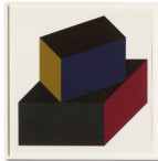
Sol Lewitt Forms Derived from a Cube (Colors Superimposed), Plate #06, 1991 Color screenprint 32 x 32 inches ed. 8/35 $5,000