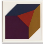
Sol LeWitt Forms Derived from a Cube (Colors Superimposed), Plate #05, 1991 Color screenprint 32 x 32 inches ed. 8/35 $5,000